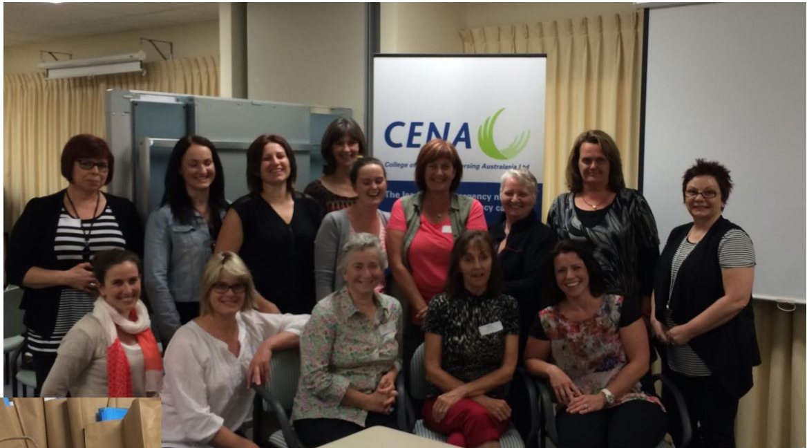
The Happy Triage "Gang"