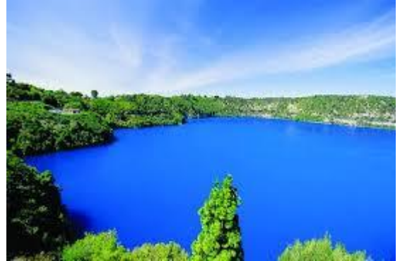
Mount Gambier's Blue Lake

We also had a team-based competition throughout the day. This was a Triage 3 v 4 game. It facilitated networking and highlighted emergency nurses great problem solving skills!!